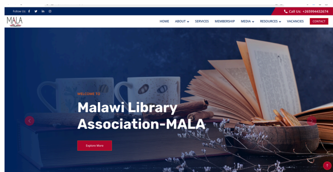
A screenshot of MALA new website

The Malawi Library Association (MALA) has officially launched its new website ( www.mala.mw ), marking a significant step in strengthening its digital presence and accessibility. The site serves as a central online hub for the association, designed to provide easy access to information about MALA's mission, services, and member resources. It includes key features such as an About Us section, contact information, details about MALA's programs, event updates, and a gallery showcasing association activities.