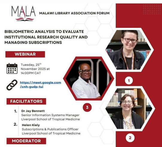
A flier for one of the the webinars organised in 2025

Going forward, the organisers plan to give more opportunities to fresh graduates who are more forthcoming unlike the veterans. There are also plans to get on board more presenters from abroad to ensure that we have a diversity of views and experiences shared on the forum.